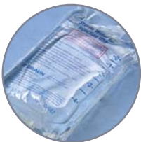
3. Sterile Water Bag