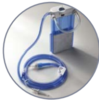
4. Heat Exchanger Cartridge