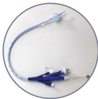
2. Prolieve Catheter