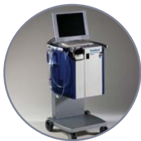
1. Prolieve System